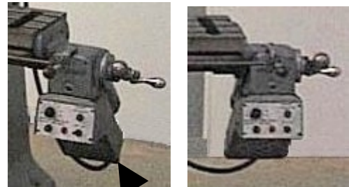
- Side View - Note 45° angle down & back

Bridgeport Electronic Feed: Replace with Servo Feed M-0206-140 or -150